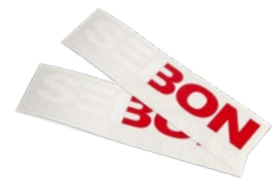
(Red, white) Part No.: DECALS-RW