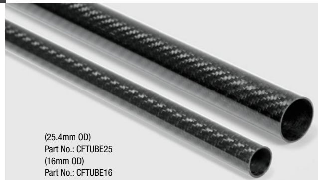
(25.4mm OD) Part No.: CFTUBE25 (16mm OD) Part No.: CFTUBE16

Dimensions: 400mm x 500mm (15 3/4" x 19 1/2") Thickness: 0.4mm (0.016") Surface: Double sided matte finish