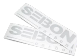
(Silver reflective) Part No.: DECALS

The original Seibon Carbon logo decals are perfect for any Seibon Carbon products, as well as windshield, side windows, or body parts display. Its size is approximately 10 inches by 2.25 inches, available in silver reflective and white, red color.