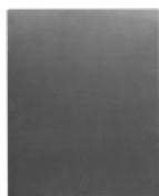
SINGLE-LAYER CARBON FIBER PRESSED SHEET Part No.: CFSHEET04

Dimensions: 400mm x 500mm (15 3/4" x 19 1/2") Thickness: 1mm (0.04") Surface: Double sided glossy, smooth finish