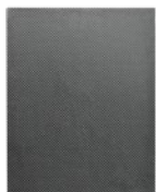
CARBON FIBER PANEL Part No.: CFSHEET10

Do-it-yourself projects are made easy with our pre-manufactured carbon fiber panels and pressed sheets. The carbon fiber panel offers high stiffness, while the single-layer carbon fiber sheets provide some flexibility for your projects. Both our panels and sheets are made from the same genuine carbon fiber material which we use in all of our products.