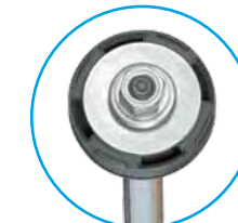
BILSTEIN Monotube Piston