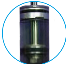
Gas-pressure shock, no foaming