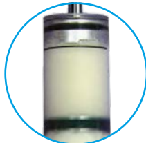
Non-pressurized shock, foaming

In a monotube gas-pressure shock absorber , the nitrogen is separated from the oil by a dividing piston. This keeps the oil column under pressure at all times to prevent the release of gas molecules while enabling the shock to deliver consistent performance under all driving conditions.