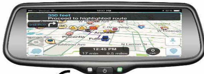
FULL 7.3" VIEW

Compatible with Android and iOS smartphones