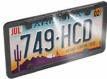
VTL375HDL BLACK FULL FRAME