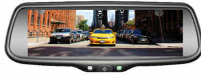
BACK UP CAMERA FULL VIEW