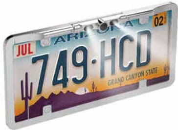
VTL275HDL CHROME FULL FRAME