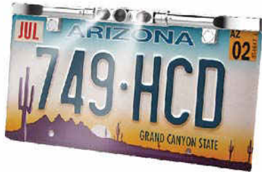
VTL405HDL CHROME BAR TYPE