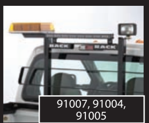
91007, 91004, 91005