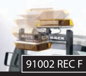
91002 REC F